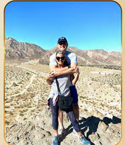
Family hike in Palm Springs