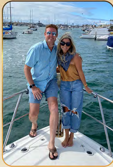
Having fun in Newport Beach