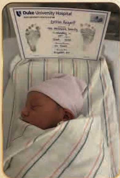
The newest addition to the Messmore family