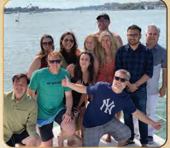
FAN Team Bonding