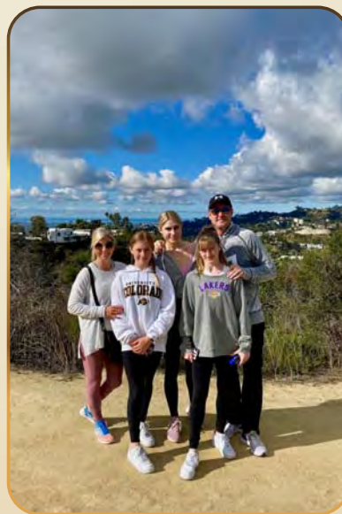
Kamps family hike in Runyon Canyon