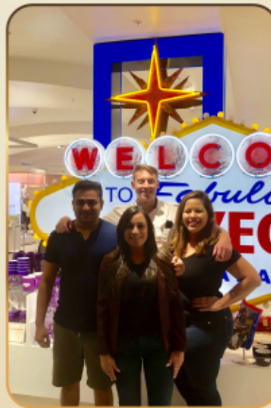
FAN team members at tax update conference