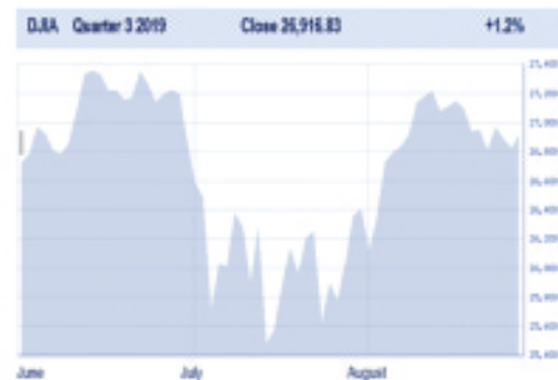
Chart Source: BigCharts.com; marketwatch.com