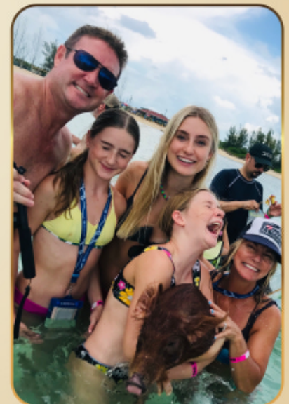
Kamps family vacation