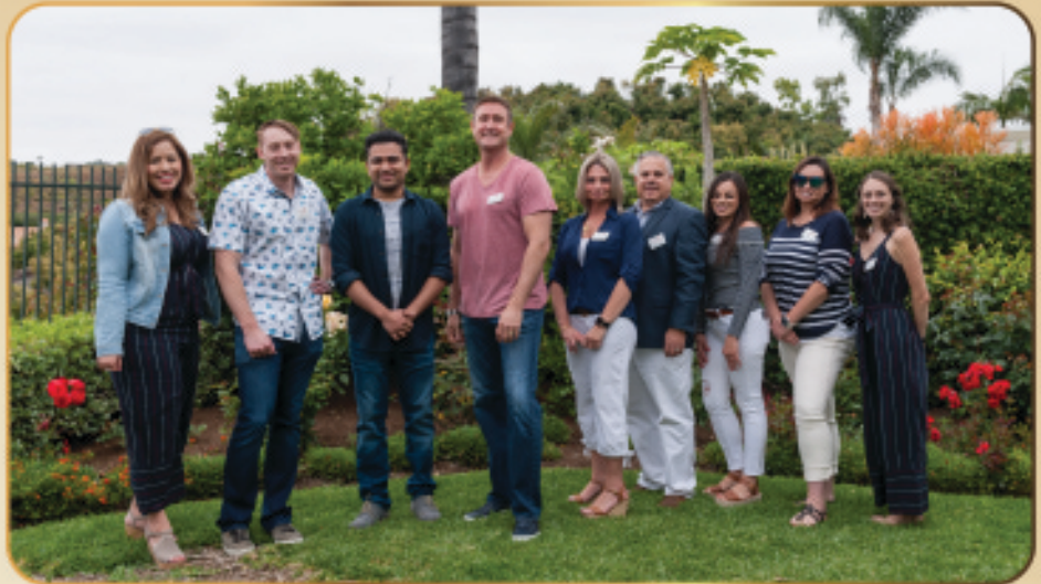
FAN Team at their annual BBQ