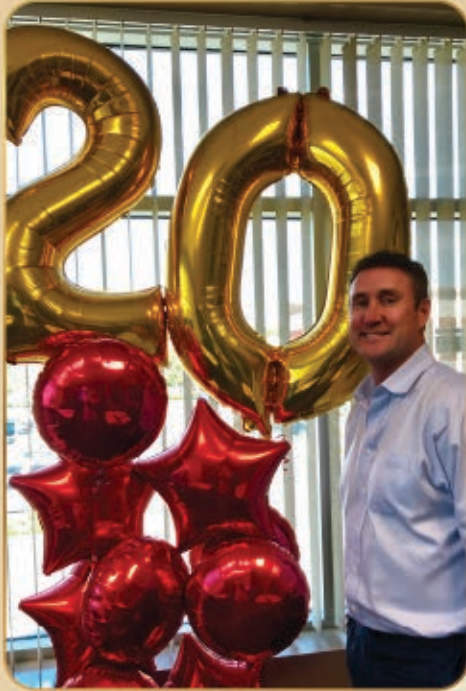
Celebrating FAN's 20th Anniversary