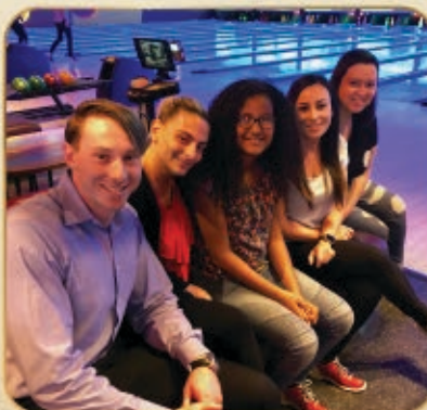
Team bonding at Bowlmor Lanes