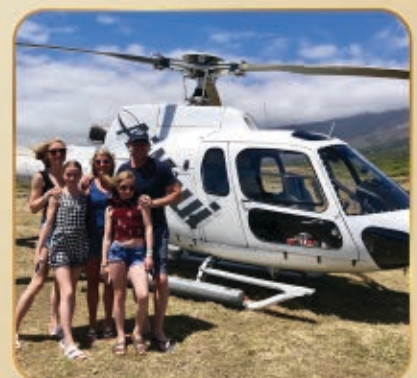
Hawaii helicopter ride