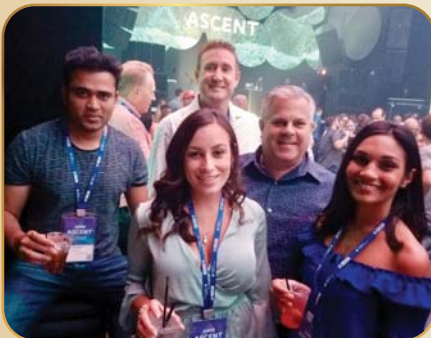
Orion Ascent Conference