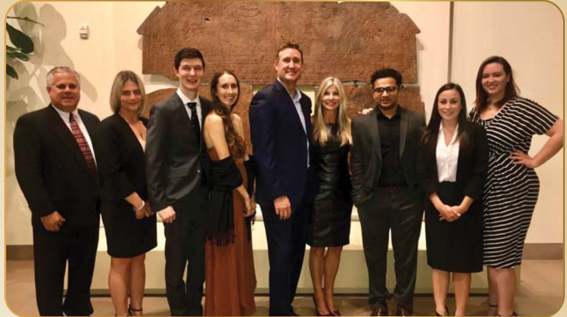
Client Appreciation Event