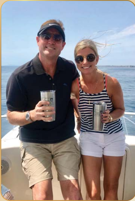
Team Bonding in Newport Beach