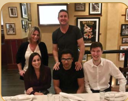
APFA Conference in Las Vegas