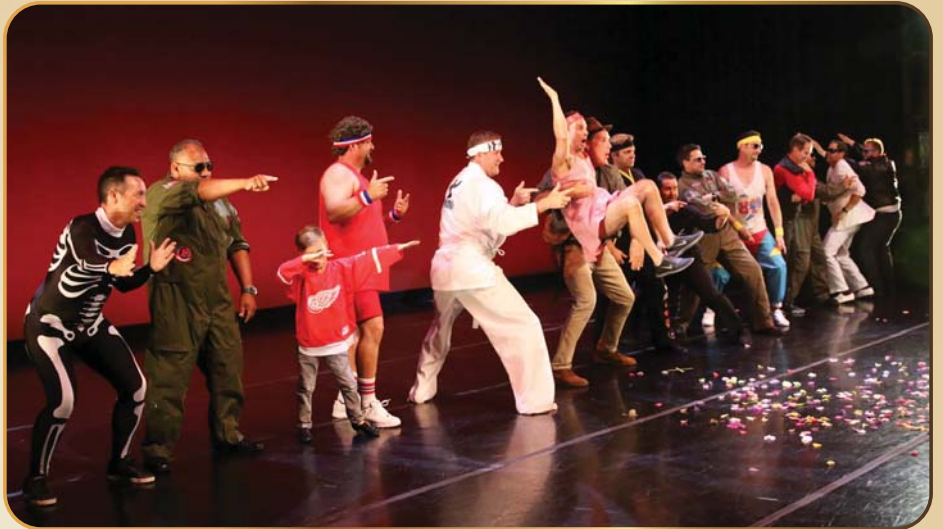
Father Daughter Dance Performance