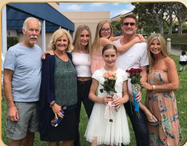
Avery's Dance Recital