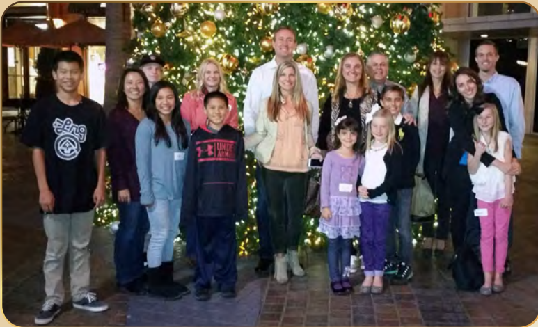
FAN clients, friends and family joined in on the holiday fun at the FAN Holiday Movie Night at Tustin AMC theatre.