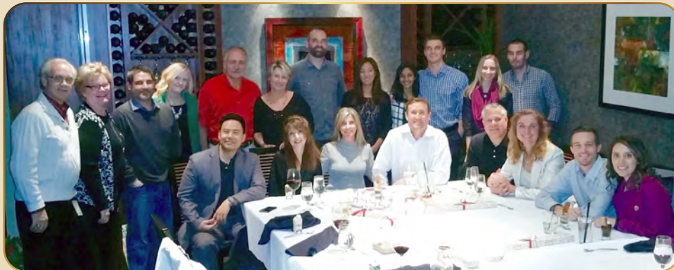
The FAN team celebrated the end of the year at the annual FAN Christmas dinner party.