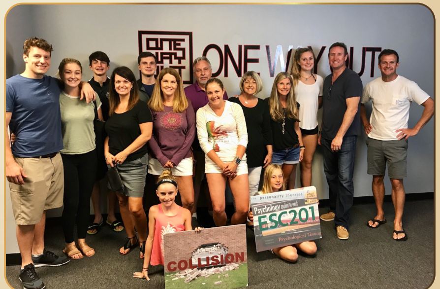
The whole family at One Way Out